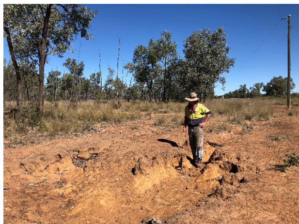
Photo. Eroded track/road.