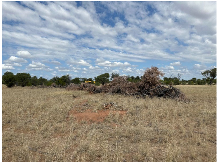
Photo left. Yeoman's plough breaks the soil's hardpan, enhancing water infiltration and root growth. Seeding introduces desired plants. Photo right. "Pushing stick contours" slows runoff and promoting water retention in the landscape. Use of these technique transformed a scalded area from 20% to 80% grass cover in 18 months.