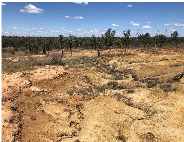
Photo. Severe erosion moving uphill.