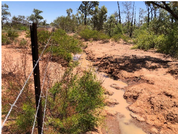
Photo. Eroded fence line

Whoa-boys are low profile, trafficable earth banks that intercept runoff flowing down a road, track, fence line or fire break and allow it to continue its natural flow direction down the landscape.